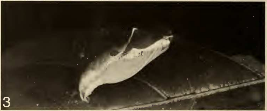
FIG. 2. Mature larva of Myscelia cyaniris cyaniris from Soberania National Park, Panama. FIG. 3. Pupa of Myscelia cyaniris cyaniris from Soberania National Park, Panama.